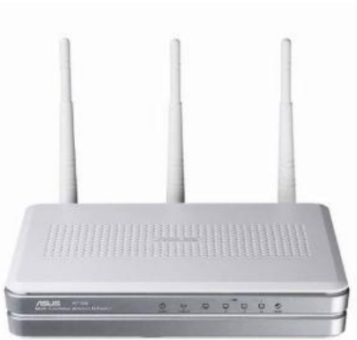
Multiple functional Gigabit Wireless N router w/ media Server ASUS RT N16