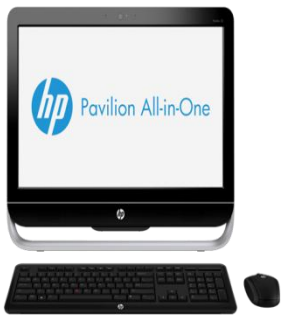
HP Pavilion 29 b1 10z all-in-one desktop Pc