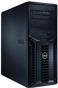
Power edge t1