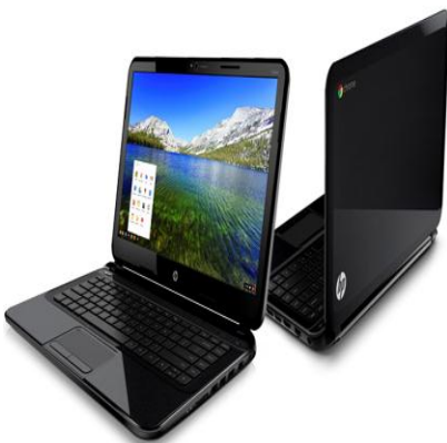
Hp pavilion 14 Chromebook