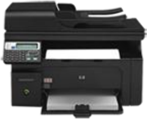
HP LaserJet Pro M1217nfw Multifunction Printer