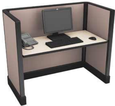
Cube solutions low height cubicle Single cubicle